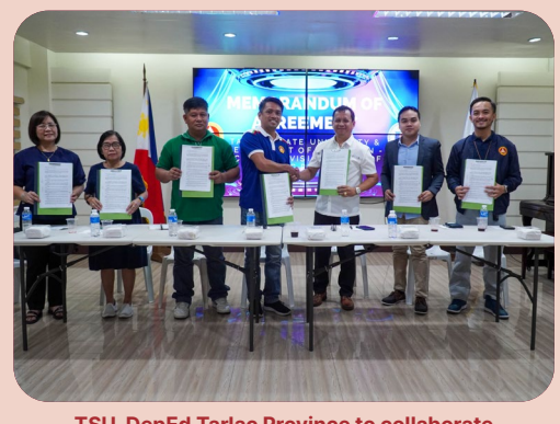
TSU, DepEd Tarlac Province to collaborate for financial literacy