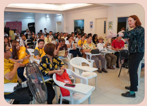
TSU Center for Tarlaqueño Studies launches lecture series with llocano Studies talk